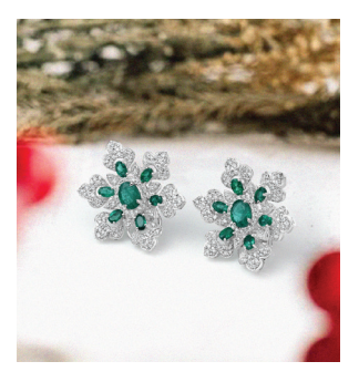
For a Friend

A delicate charm bracelet—because friendship deserves to sparkle too.